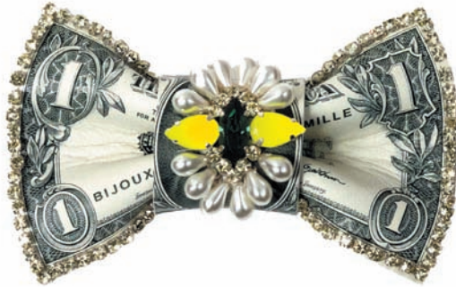
Sunny City Bill hair pin

Printed leather embroidered with crystals and pearl beads.