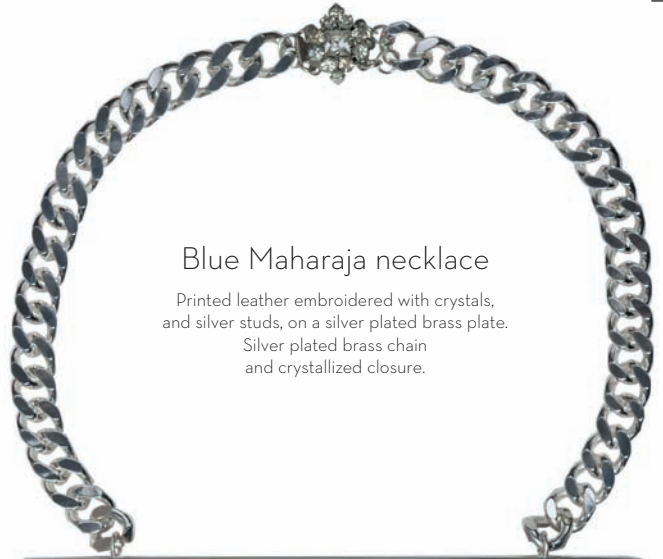
Blue Maharaja necklace

Printed leather embroidered with crystals, pearl beads and silver studs on a silver plated brass cuff.