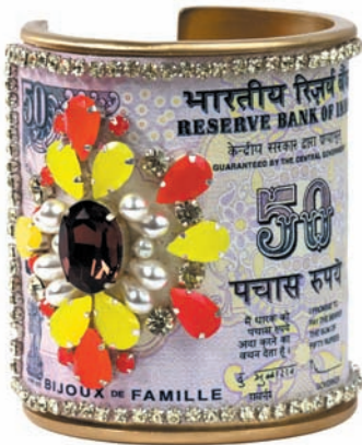
Pink Maharani cuff

Printed leather embroidered with crystals and beads, on a gold plated brass cuff.