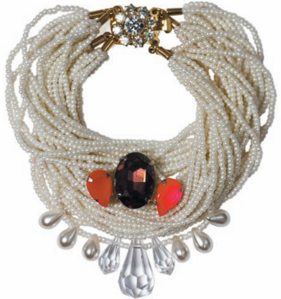
Shiva cat necklace

Printed leather embroidered with crystals and pearl beads.