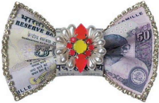
Little Pink Pacha hair pin

Printed leather embroidered with crystals and pearl beads.