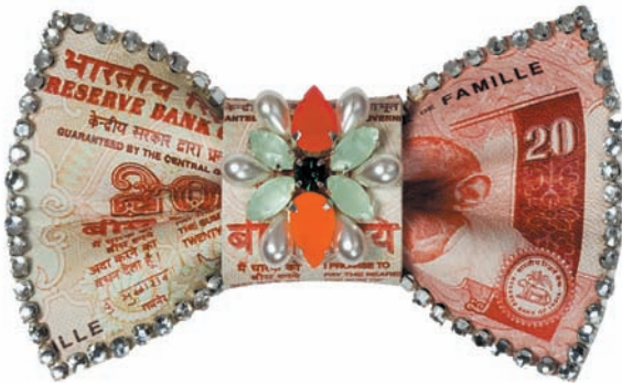
Happy Darjeeling hair pin

Crystals, pearl beads and crystals pendant on pearl beads bracelet. Crystallized closure. Exist in smaller size for bracelet.