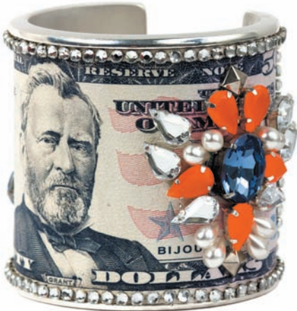
American Dream cuff

Printed leather embroidered with crystals, pearl beads and silver studs on a silver plated brass cuff.