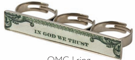
OMG ! ring

Printed leather embroidered with crystals and gold studs, on a gold plated brass plate. Gold plated brass chain and crystallized closure.